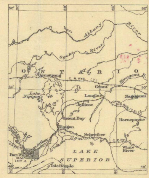
Scale, 1 inch to 100 Miles