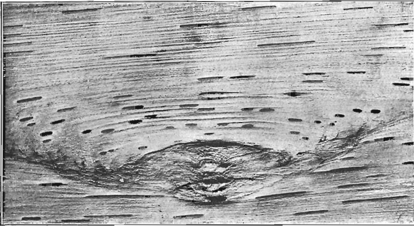
Figure 2. Markings on birch bark.