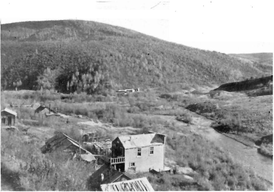
A. Grand Forks, Bonanza Creek; during the Klondike gold rush this place had a population of several thousand.