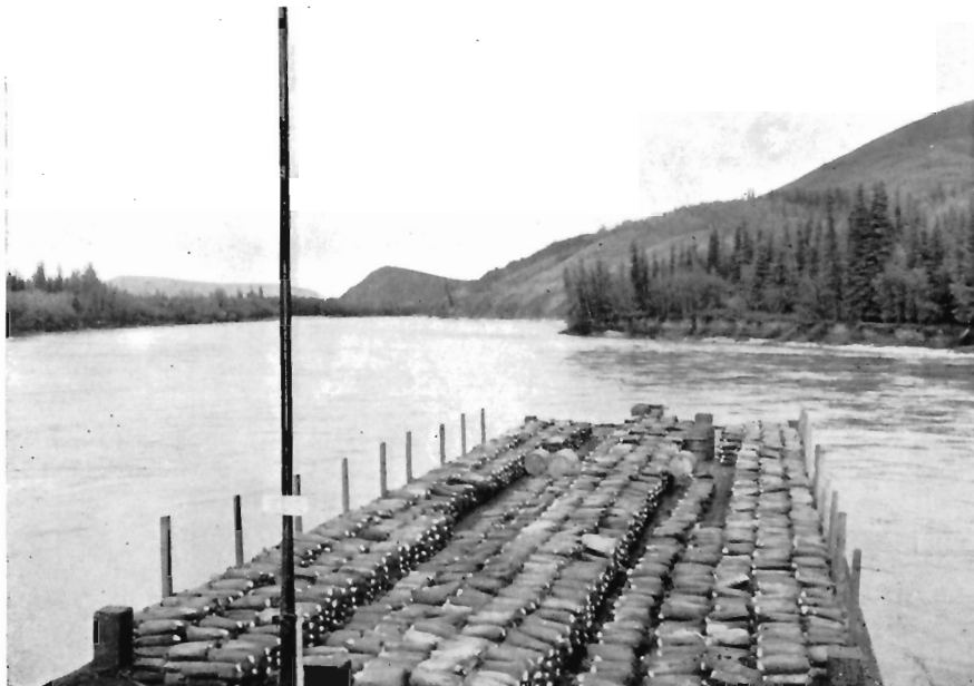
B. A barge on Stewart River loaded with more than 200 tons of ore and concentrates from the silver-lead mines of Mayo district.