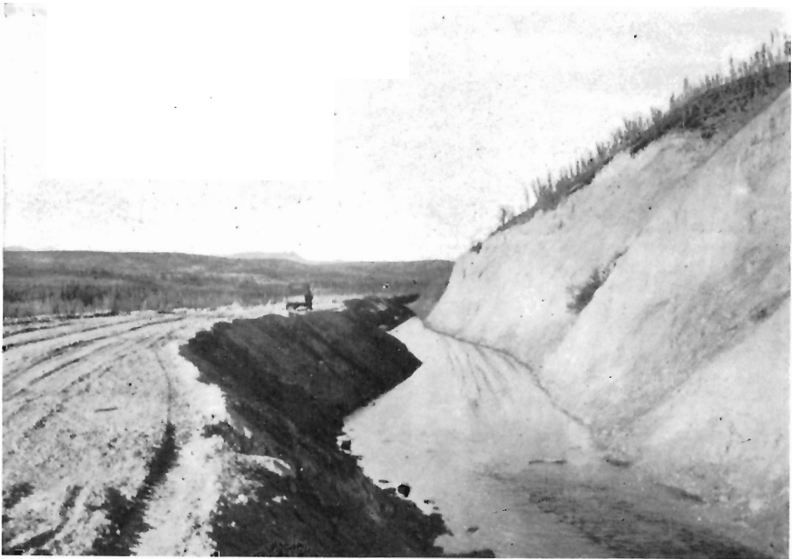
B. Ditch carrying water from South Klondike River to North Klondike River for the hydroelectric plant.